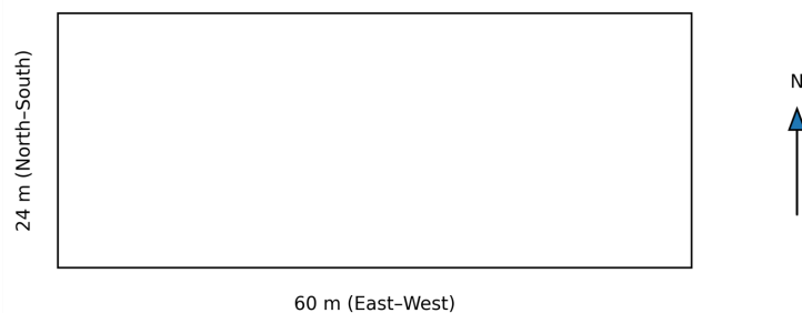
Figure 2: Academic Hall North footprint

Notably, Sungrove University is planning to retrofit its Academic Hall North. It is a two-story classroom and office building. The interior layout combines perimeter offices and classrooms with interior corridors. The building has a rectangular footprint ( 60\text{m} \times 24\text{m} ) with its long side aligned east-west as shown in Figure 2 . The facade consists of double glazing and a brick veneer with an average window-to-wall ratio of 45% on the south facing side and 30% on the remaining sides. The building relies on mechanical cooling in the summer and hydronic heating in the winter with limited passive strategies in place. Additional features of this notional building are yours to imagine. Ensure you communicate these features in your writing to COMAP.